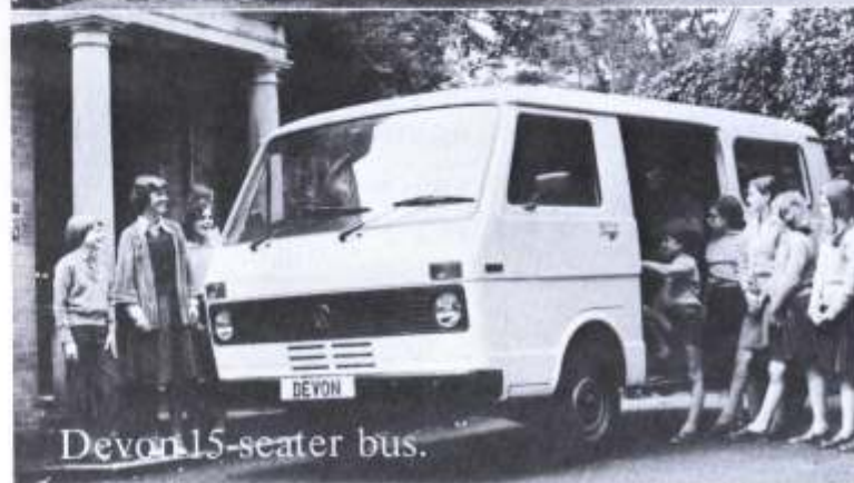
Devon 15-seater bus.