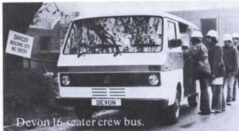
Devon 16-seater crew bus.

And for hospitals, for patients and staff.