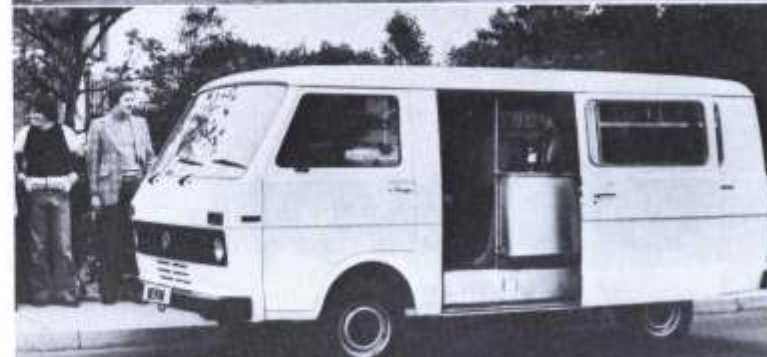
Devon 12-seater PSV.