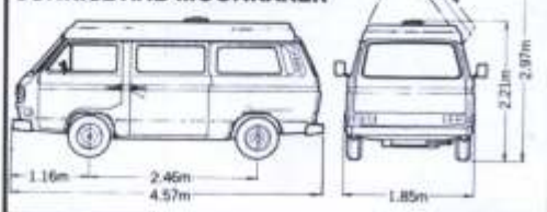
EXTERIOR DIMENSIONS OF SUNRISE AND MOONRAKER

Trade Descriptions Act 1968. The policy of Devon Conversions Ltd is one of continuous development, and they reserve the right to change specifications and prices without notice.