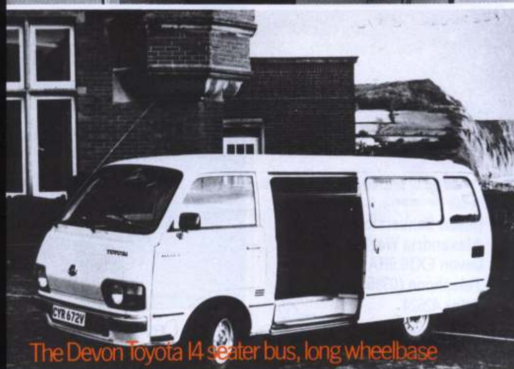
The Devon Toyota 14 seater bus, long wheelbase