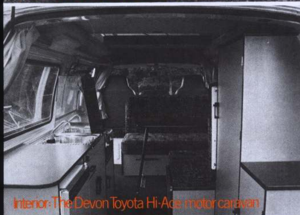
Interior: The Devon Toyota Hi-Ace motor caravan