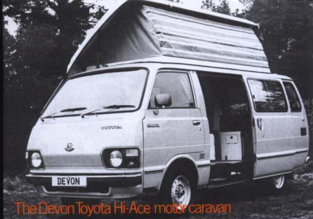
The Devon Toyota Hi-Ace motor caravan