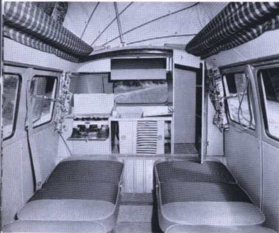
Interior view showing "Dormatic" seats in bed or bench position and cooker, sink, lockers and wardrobe, the cabinet work is all steel.