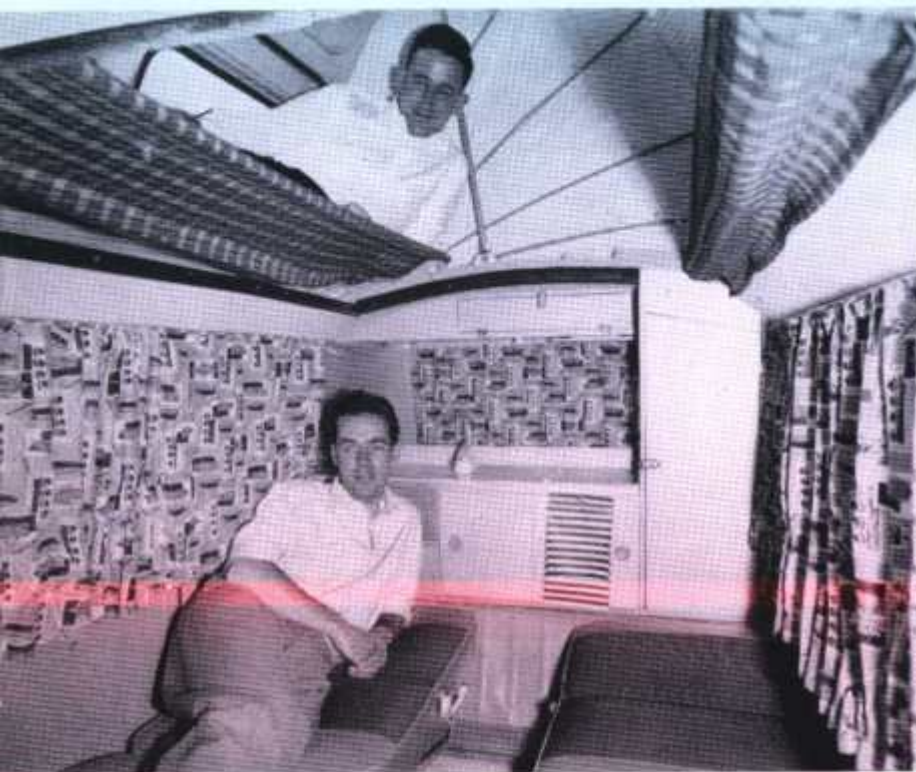
View showing seats arranged for sleeping and top bunks (one open and one closed)